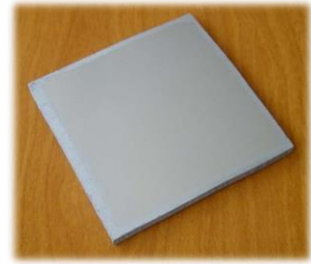
Ag coating sample

Sample: 50 x 50 mm plastic coated with an Ag film